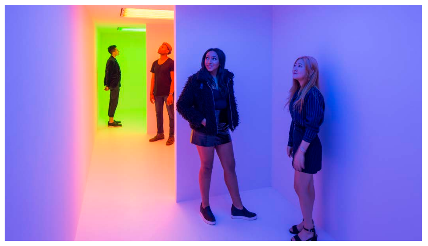
Carlos Cruz-Diez, Chromosaturation, 1965/2017, site-specific installation

"One of the purposes of my art is to expand the scope of human experience, granting it more complexity and subtleness."