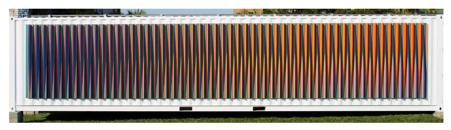
Carlos Cruz-Diez, Physichromie SCAD, 2017, clear coated UV pigment on lacquered aluminum, PVC

"I wanted to find a way to use color so that it was not a painted testimony but a reality that expressed its own condition – that is, the reality of light."