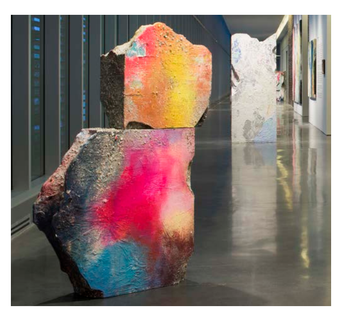
José Parlá , Modern Ancient , 2016, acrylic, ink, oil, enamel paint, plaster and paper on wood