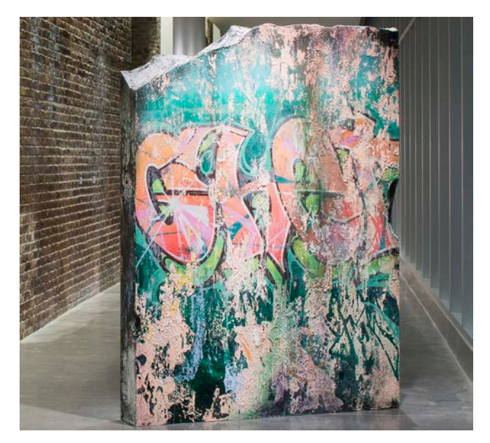
José Parlá , Ghetto , Miami , FL , 2014, acrylic, ink, oil, enamel paint, plaster and paper on wood

How do Parlá's sculptural forms illuminate the links you've created between your own ideas and experiences? Below, craft a description of his sculptural work and, drawing on your own personal, cultural and historical perspectives, analyze how the independent influences of both Parlá as the creator and you as the viewer unite to shape the overall artistic experience.