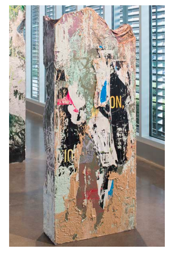
José Parlá, West Liberty Street and Whitaker Street, Savannah, Georgia, 1991, 2014, acrylic, collage, ink and enamel on wood

Though Parlá's sculptures resemble his paintings in many ways, three-dimensional forms invite a different type of awareness and experience for viewers. What influence does the threedimensional form have on your perception of Parlá's work? Record your thoughts in the space below.