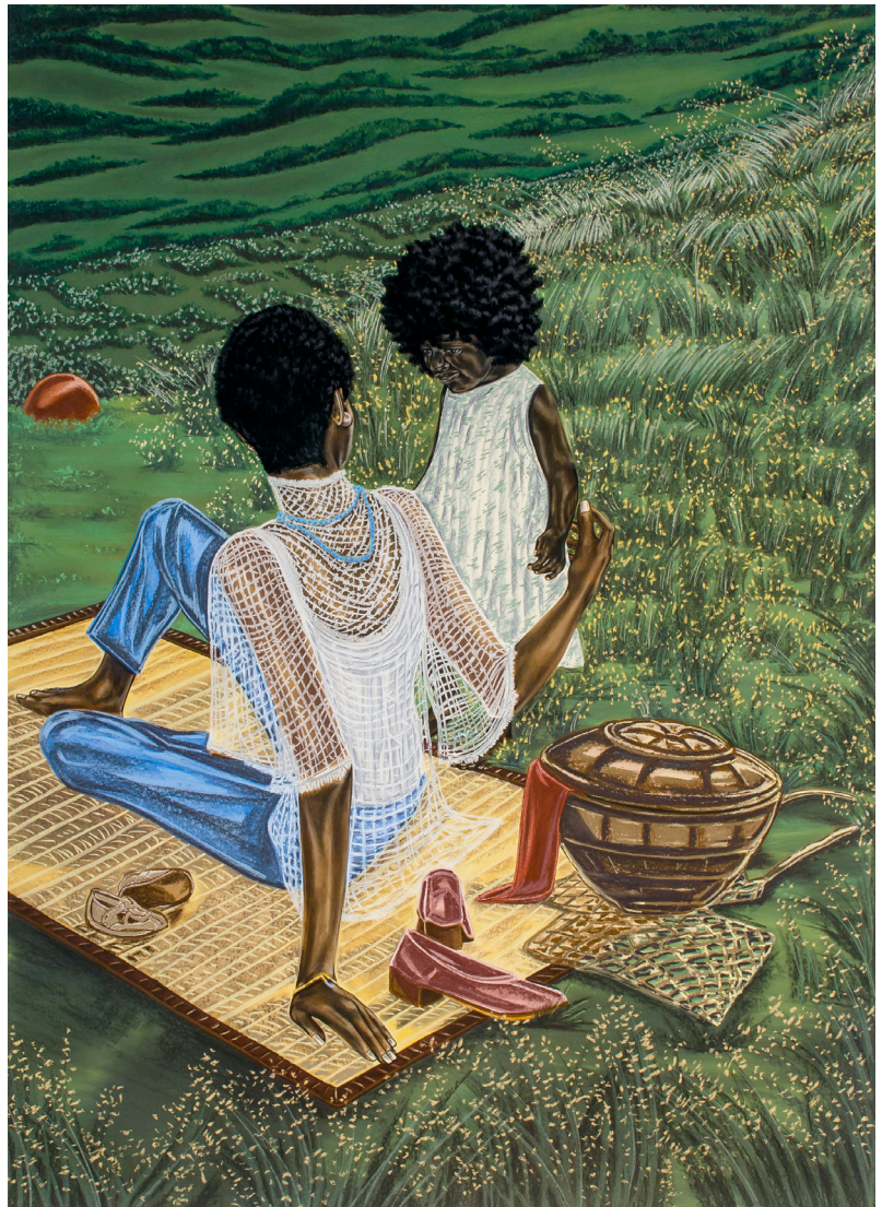
Toyin Ojih Odutola, Picnic on the Grounds , 2017-2018, charcoal, pastel and pencil on paper. Courtesy of the artist and Jack Shainman Gallery, New York.

Use a questioning technique to expand your way of seeing. Carefully question your response on the facing page — challenge assumptions and seek out alternative possibilities. Asking friends for their perspectives will be helpful. Describe what you discover below. What was your previous answer hiding? What did your questions expose?